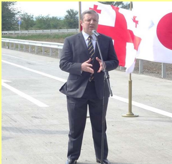
Speech by the Prime Minister of Georgia, H.E. Mr. Giorgi Kvirikashvili

Prime Minister, H.E. Mr. Giorgi Kvirikashvili expressed his deep gratitude to Japan for this support and stressed the importance of the project for development of Georgia and the whole region.