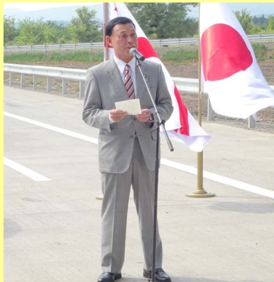
Speech by the Parliamentary Vice Minister for Foreign Affairs of Japan, Mr. Motome Takisawa